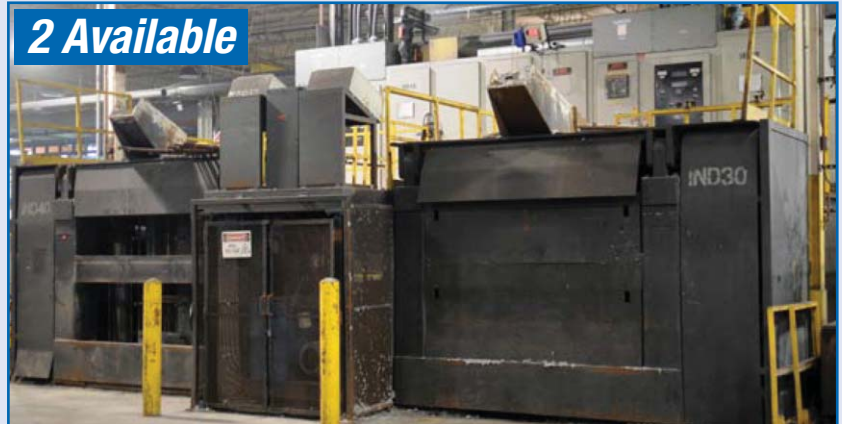
ABP MK17 CORELESS INDUCTION MELTING FURNACES