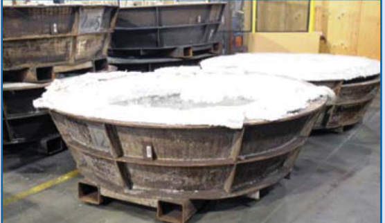
PARTIAL VIEW OF SHEET MOLDS AVAILABLE