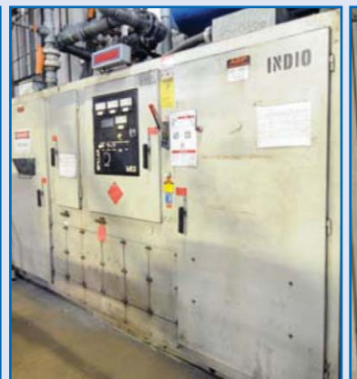
PILLAR MK8 CORELESS INDUCTION MELTING FURNACE CONTROLS