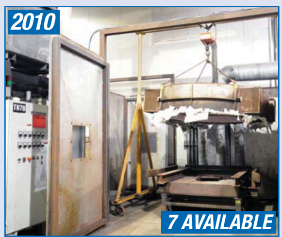
S&A INDUSTRIAL SHEET MOLD HEATING SYSTEM