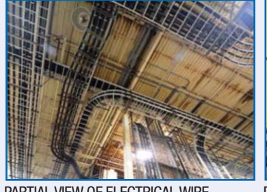
PARTIAL VIEW OF ELECTRICAL WIRE