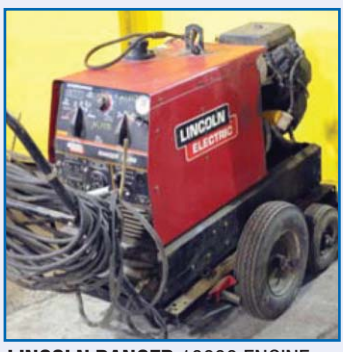
LINCOLN RANGER 10000 ENGINE DRIVEN WELDER