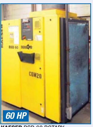
KAESER BSD 60 ROTARY SCREW AIR COMPRESSOR