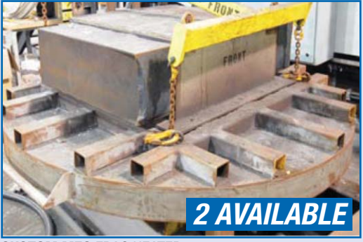
CUSTOM MFG FRAC HEATER