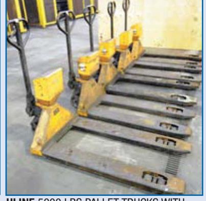
ULINE 5000 LBS PALLET TRUCKS WITH SCALES