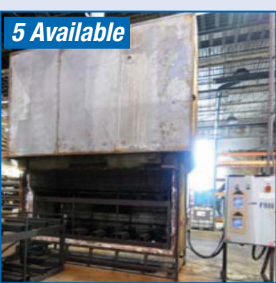
PSH FB-5000 F FRONT LOADING ELECTRIC KILN