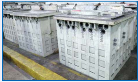
PARTIAL VIEW OF TOTES FOR ACID WASH AVAILABLE