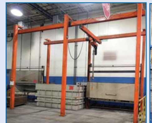
GORBEL FREE STANDING FLOOR SUPPORTED