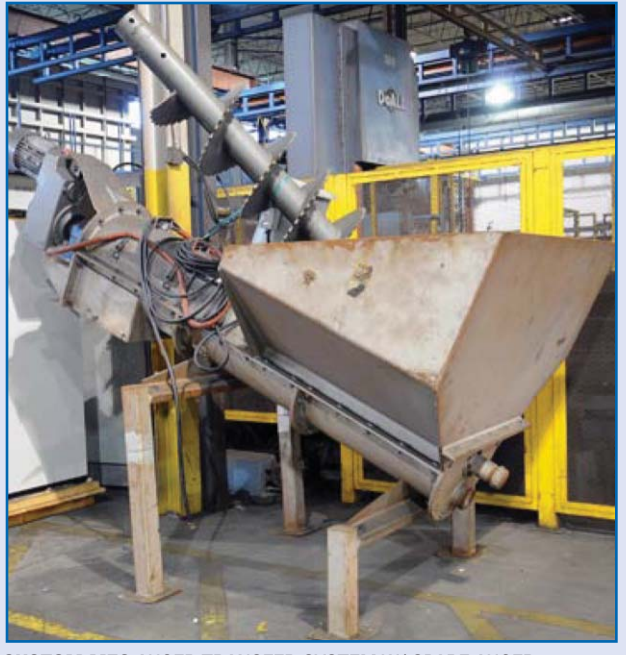
CUSTOM MFG AUGER TRANSFER SYSTEM W/ SPARE AUGER