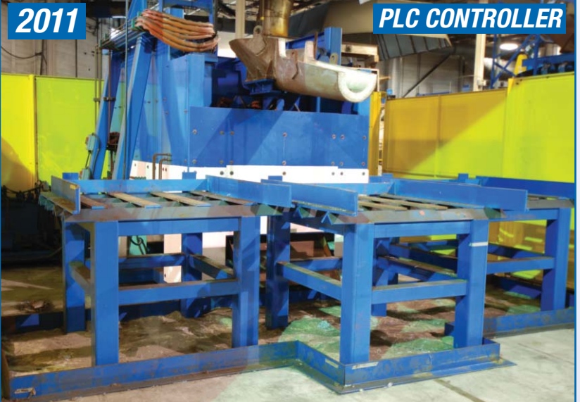
ECLIPSE AUTOMATED POURING I ADI E

Auction: Thursday March 31, 10:30 AM (ET) Inspection: Wednesday March 30, 9 AM to 4 PM