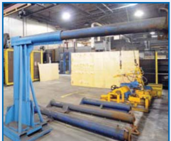
PARTIAL VIEW OF LIFTING ACCESSORIES