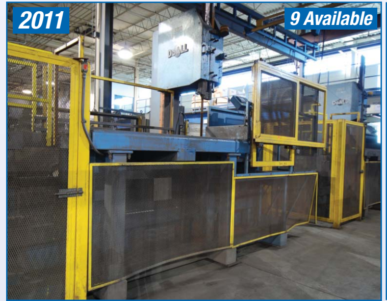
DOALL D900 VERTICAL DIAMOND BAND SAWS