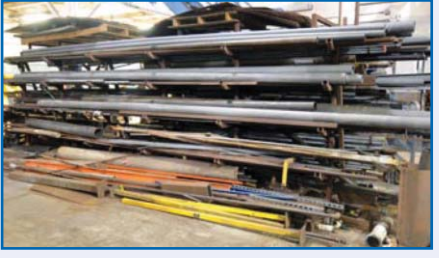
PARTIAL VIEW OF RAW MATERIAL INVENTORY