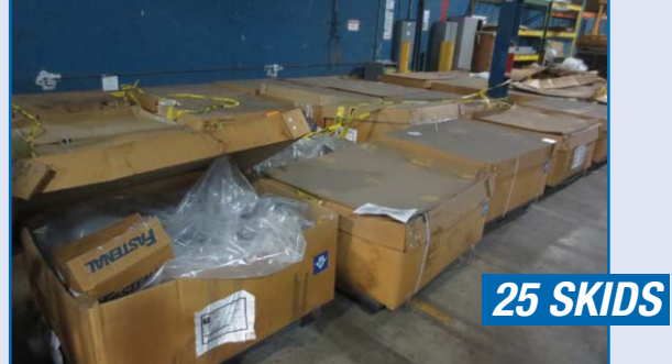
LARGE QUANTITY OF UPGRADED METALLUGRICAL SILICON