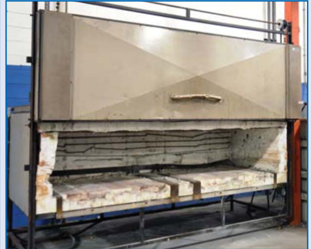
PSH K623-2416-P FRONT LOADING ELECTRIC KILN