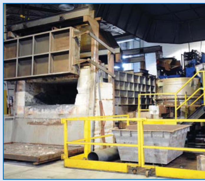
CANENG NATURAL GAS FIRED REVERBERATORY MELTING FURNACE