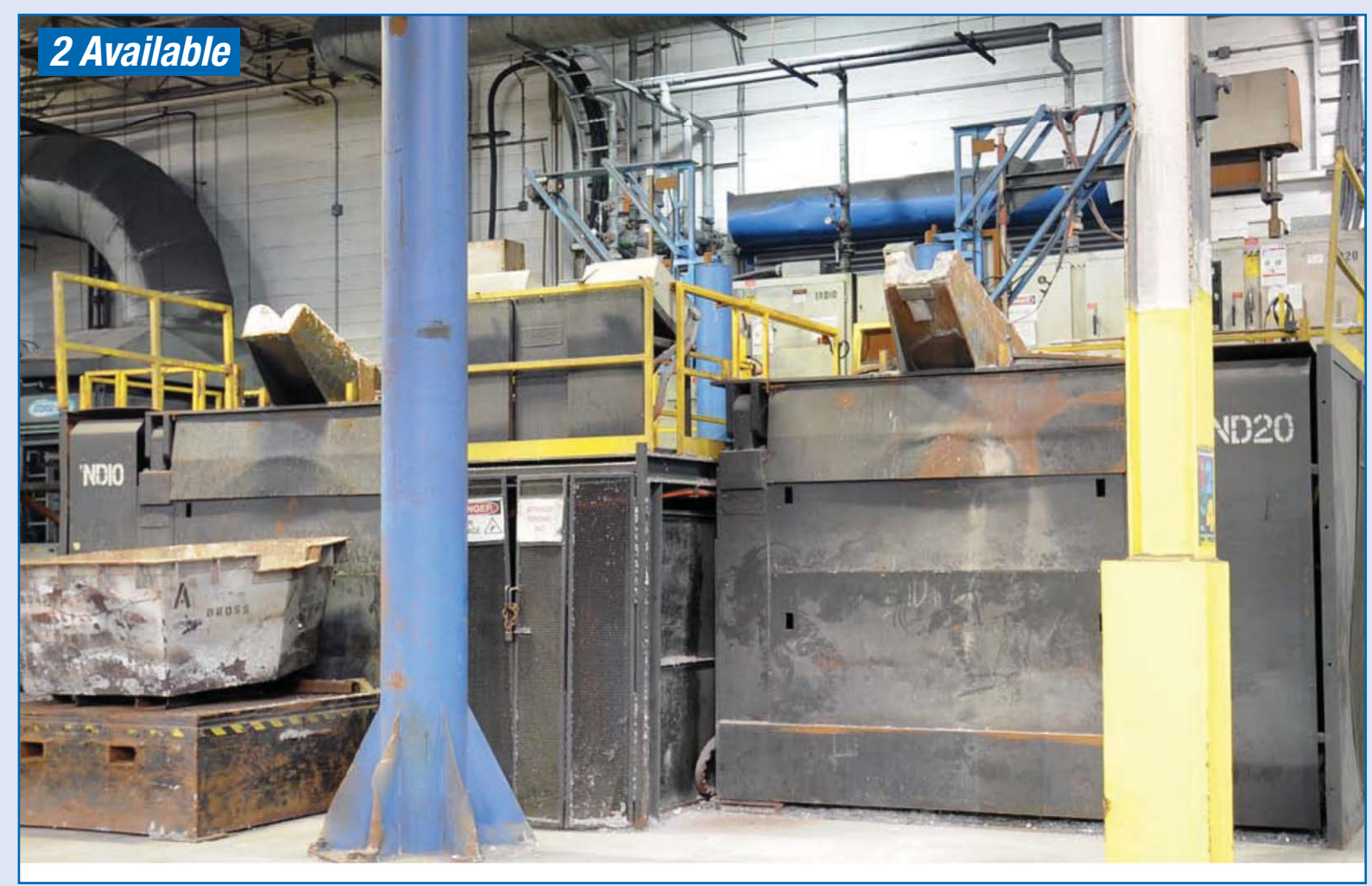
PARTIAL VIEW OF ABP CORELESS INDUCTION MELTING FURNACES