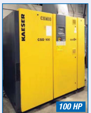
KAESER CSD 100 ROTARY SCREW AIR COMPRESSOR