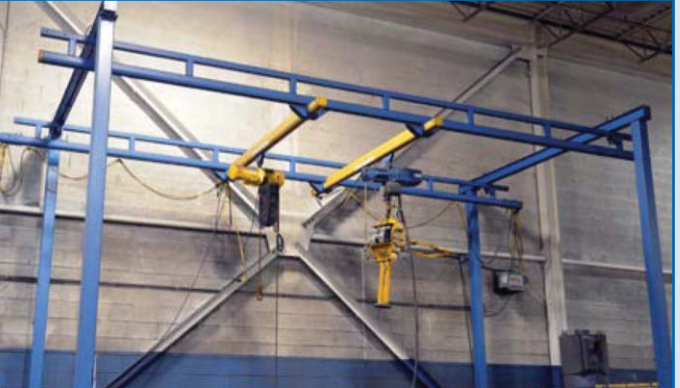
GORBEL FREE STANDING FLOOR SUPPORTED CRANE SYSTEM