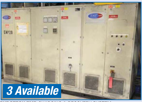
PYROTECK EMP CHARGING & RECOVERY SYSTEM