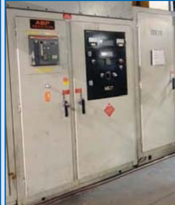
ABP MK17 CORELESS INDUCTION MELTING FURNACE CONTROLS