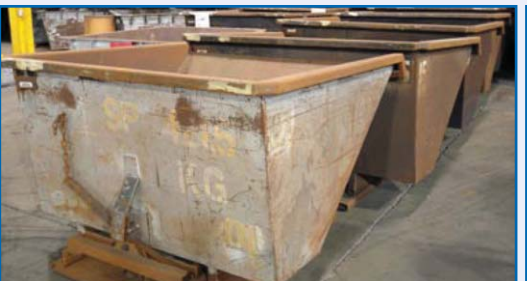
PARTIAL VIEW OF DUMPING HOPPERS