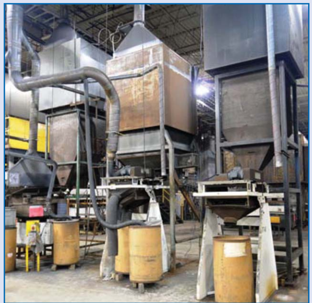
MIDWEST INDUSTRIES UNIVERSAL VIBRATING SCREENS