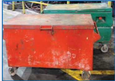
PARTIAL VIEW OF J0B BOXES