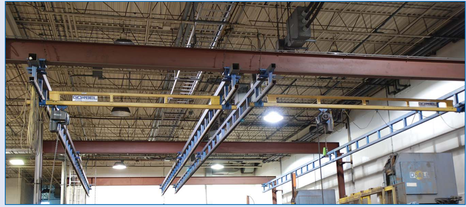
PARTIAL VIEW OF GORBEL CRANES AVAILABLE