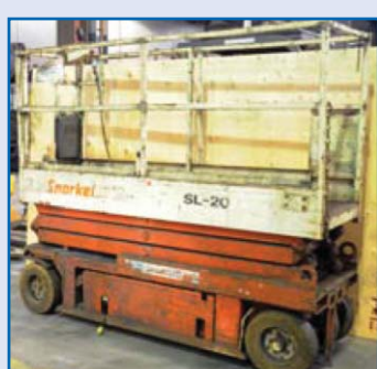
SNORKEL SL20 PLATFORM LIFT