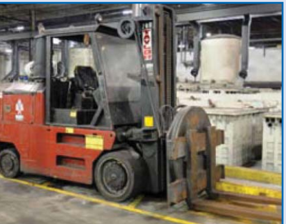
TAYLOR TC200S LPG FORKLIFT