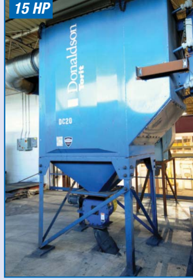
TORIT DF03-12 DUST COLLECTOR