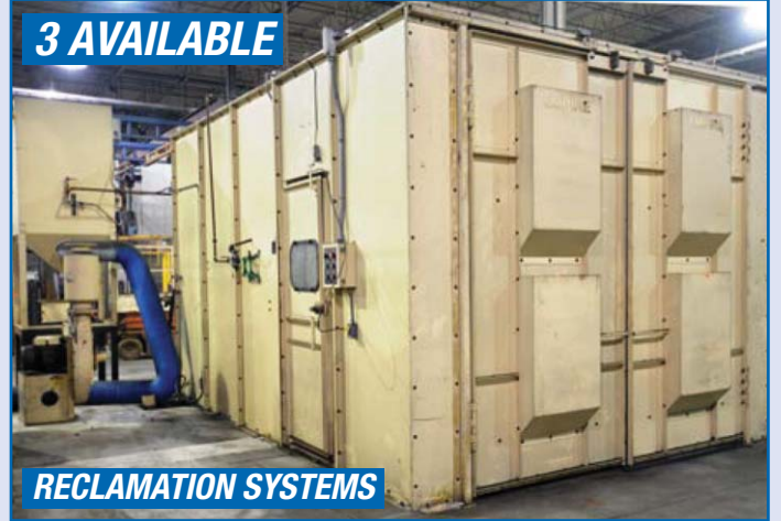
EMPIRE 18' X 11' X 10' COMPLETE SHOTBLAST BOOTH